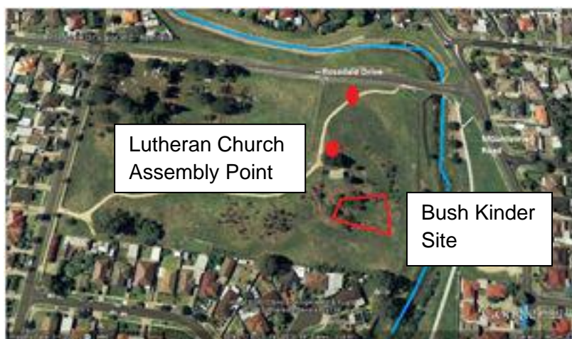
Figure 1 - Assembly Point A Lutheran Church

Assembly point A: Ziebell Farmhouse Veranda